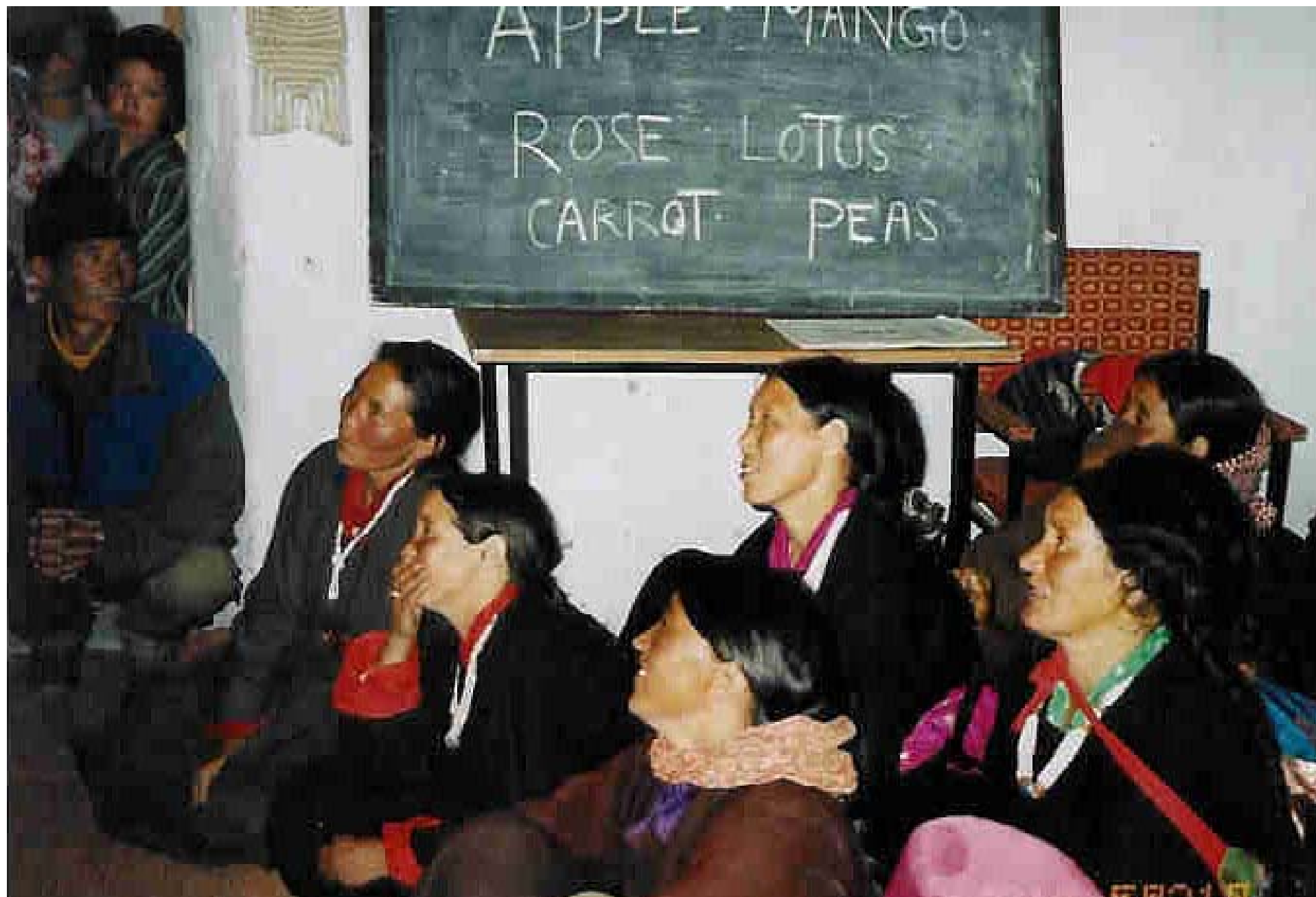
Earnest students of Saboo Village